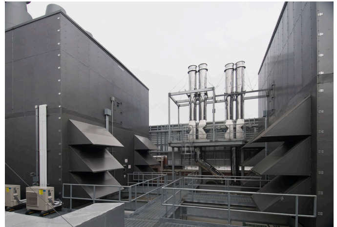
Lab Exhaust Units

Please see reverse side for an in-depth look at Governair's industrial capabilities.