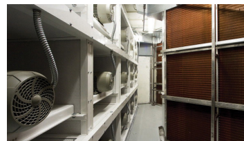
FANWALL System Redundancy