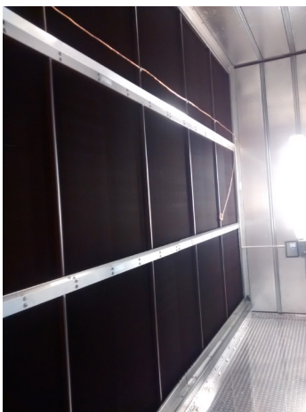
Stainless Steel Construction